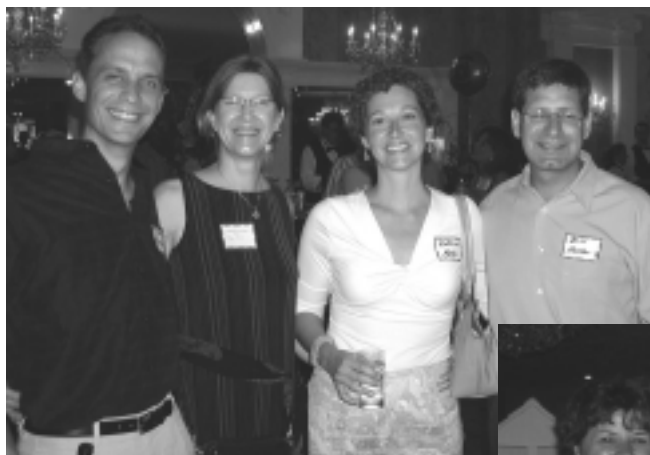
Alumni celebrate Amherst's birthday