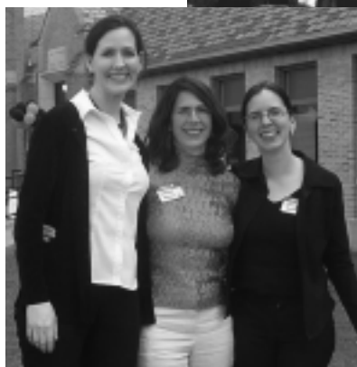
The Burton sisters