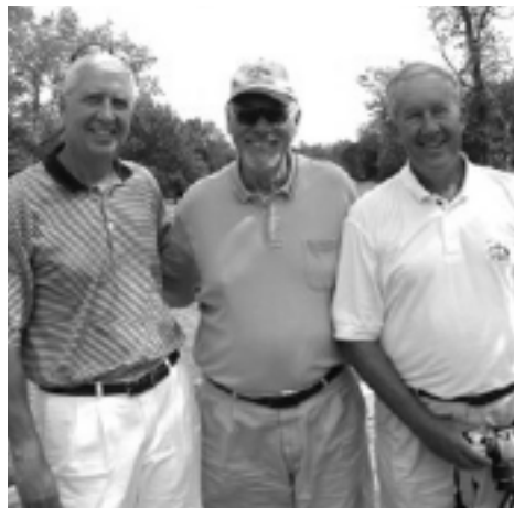
Friends of all ages joined together at the Classic.