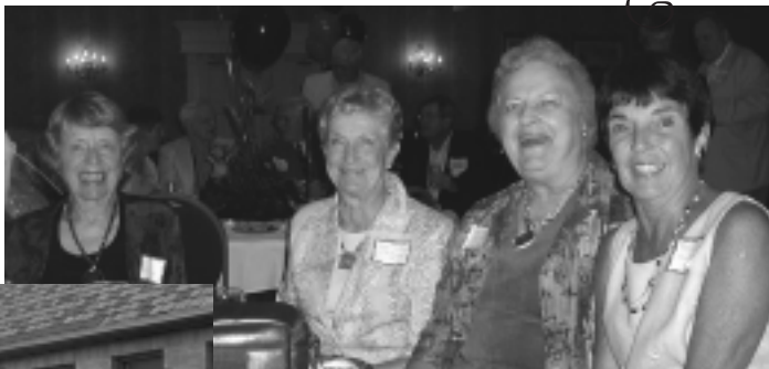
Friends share a laugh at Samuel's Grande Manor