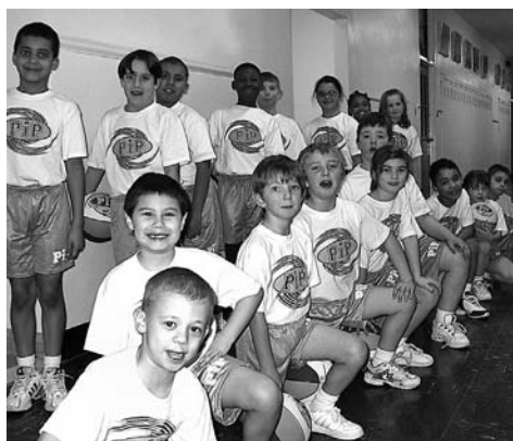
Young members of the PIPs team.

The past year has been a very successful one for the ACAF Grant Committee; we awarded four grants totaling just over $4,000 for the 2005-06 school year. Specifically, the Grant Committee was able to assist with the funding for a Windermere fifth grade field trip to the Rochester Museum of Science; a