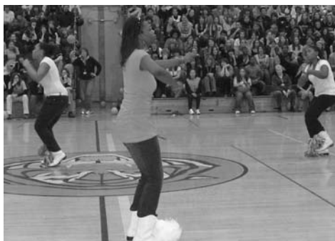
The high school drill team shows off their moves and their new uniforms.

All of these grants would not have been possible without the generous support of so many of our alumni. Each grant request is carefully reviewed by the Grant Committee and must meet certain criteria before it is recommended to the ACAF Board of Directors for final approval. The Grant Committee strives to award grants that benefit the greatest